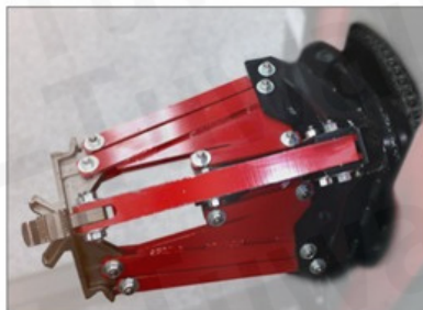
TAPERED ROLLER BEARINGS