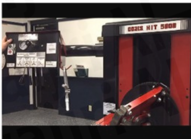
EASY-TO-USE SWING ARM